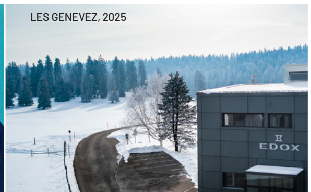
LES GENEVEZ, 2025

CH - 2714 LES GENEVEZ WWW.EDOX.CH MEDIA CONTACT: INFO@EDOX.CH